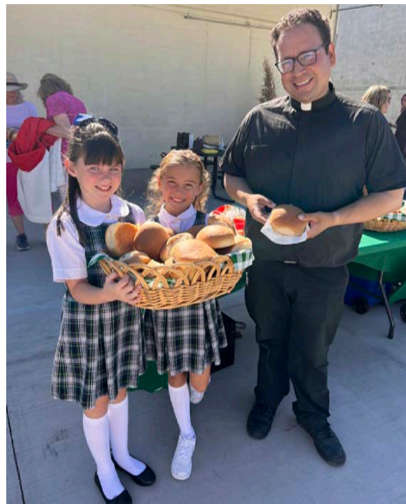
First Day of School—August 2023

Father John C. Silva Education Foundation P.O. Box 4304 Modesto, CA 95352